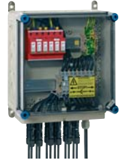
PV generator junction boxes