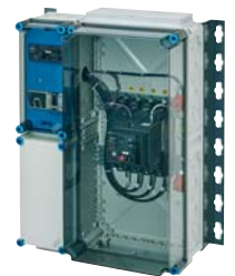
Distributor with metering