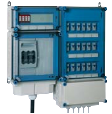
Solar inverter collectors