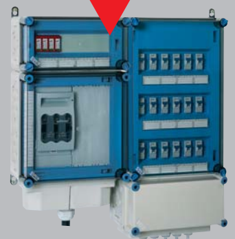
Solar inverter collectors