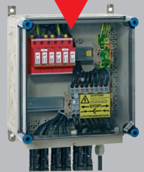
PV generator junction boxes