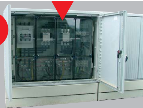
Distributor with metering